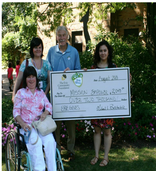
Mission Empower receiving Erie Gives Check 2013

Your Receipt: You will receive an email receipt of your gift, which you should retain for tax purposes. Unless you choose to remain anonymous, your donor information will be sent to the appropriate organizations