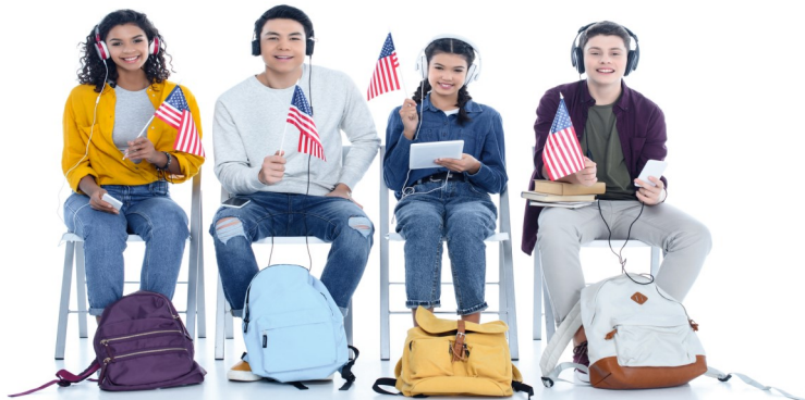
Students sitting with backpacks holding American flags