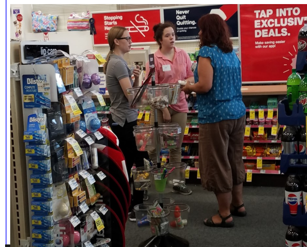
Students helping a customer at a CVS store