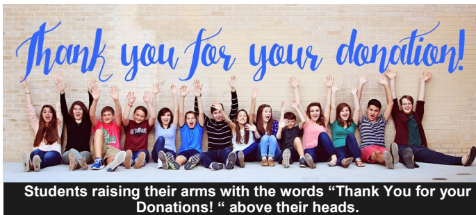
Students raising their arms with the words "Thank You for your Donations!" above their heads.